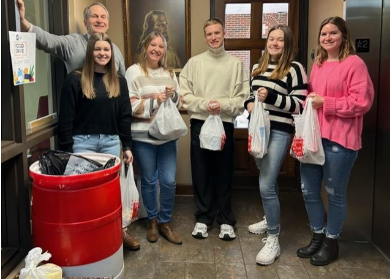
THANK YOU !!

FEBRUARY FOOD DRIVE--- The month of February we are sponsoring a food drive for The Link. The food drive wraps up Feb. 26 th . Items needed: Regular size boxes and cans needed items: Pop top canned soups, saltine crackers, mac and cheese, canned tuna or chicken, peanut butter, rice, pasta and pasta sauces, cereal bars, assorted cereals. Food collection bins locations: Inside the front door next to the church office and preschool entry.