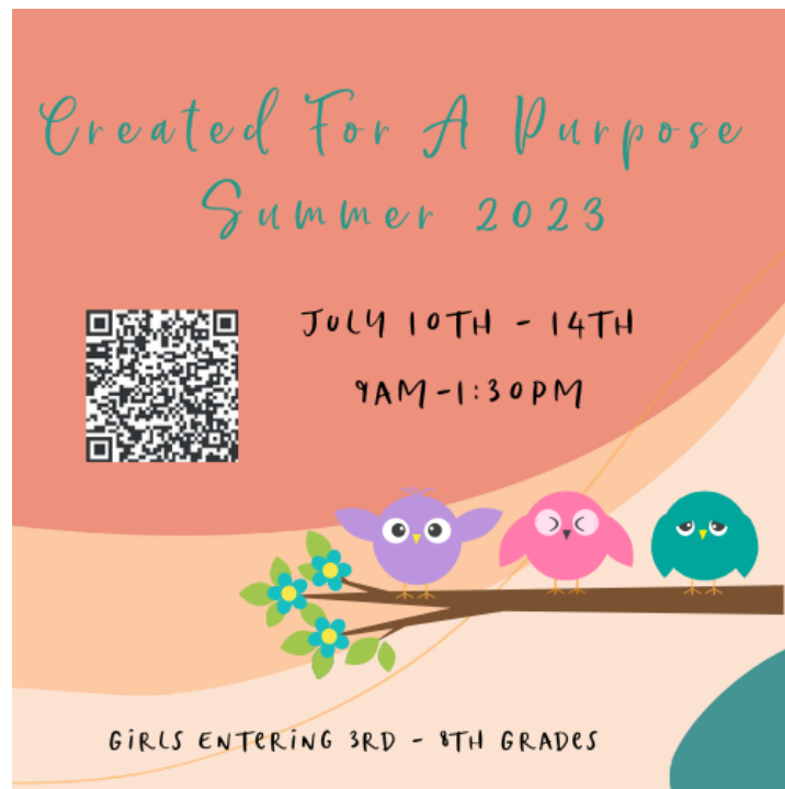
Created for a Purpose for Girls Registration