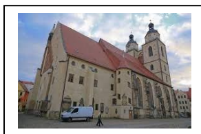
St. Mary's Church