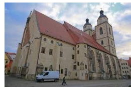
St. Mary's Church