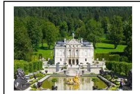
Linderhof Castle Tauber