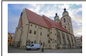
St. Mary's Church