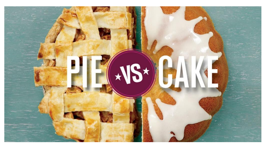
Who will take top honors in each category? Will it be YOU??????/

If you would like to bring a dessert not for the contest, let us know that too. BUT WE HOPE you will enter the contest for fun!