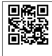
Connect QR Code

We would love to connect with you if you have been visiting SJ's for a while or if you would like to more information about us. Fill out a CONNECT Card (found in the pew rack),online ( sjepc.com ).